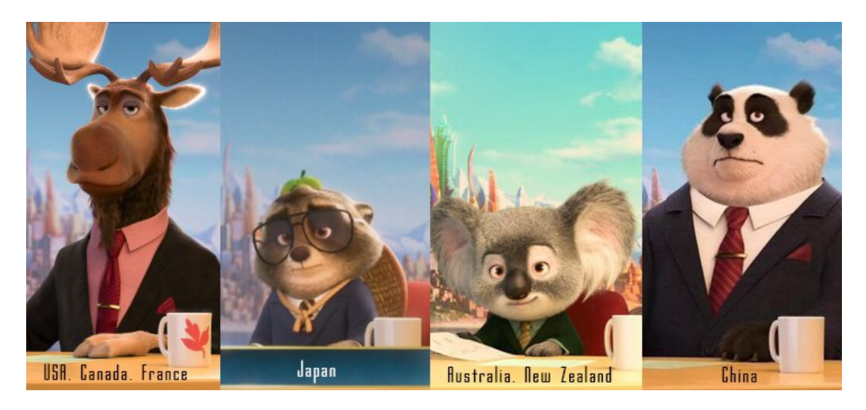
#Zootopia newscasters by region. US/moose, Japan/tanuki, Australia/koala, China/panda, UK/corgi, Brazil/jaguar.